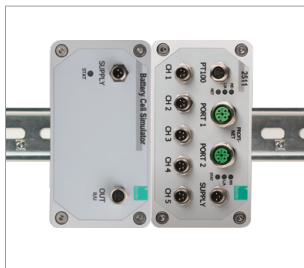
2500-Z100 + 2511 on mounting rail