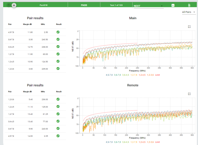
TREND AnyWARE Cloud Test Result screen

To upgrade your LanTEK II using our Lifetime Support Promise, please email uksales@trend-networks.com